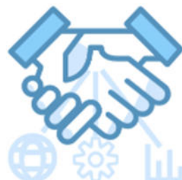
Accreditation of adult education course in CEE countries