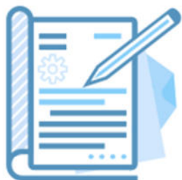
Scientific Review What Works in Age Management