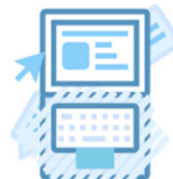
Course materials for blended learning