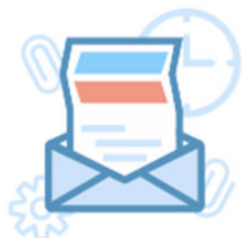
Qualification standard of Age management Advisor