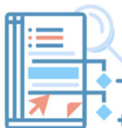
Guidelines of Age Management Curriculum Implementation