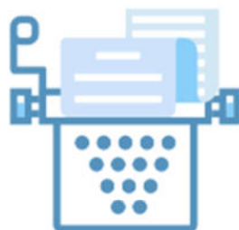
Age Management curriculum